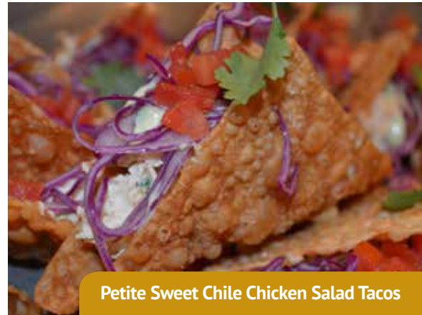
Petite Sweet Chile Chicken Salad Tacos