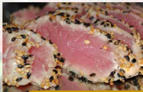
Seared Ahi Tuna