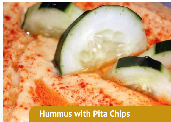
Hummus with Pita Chips