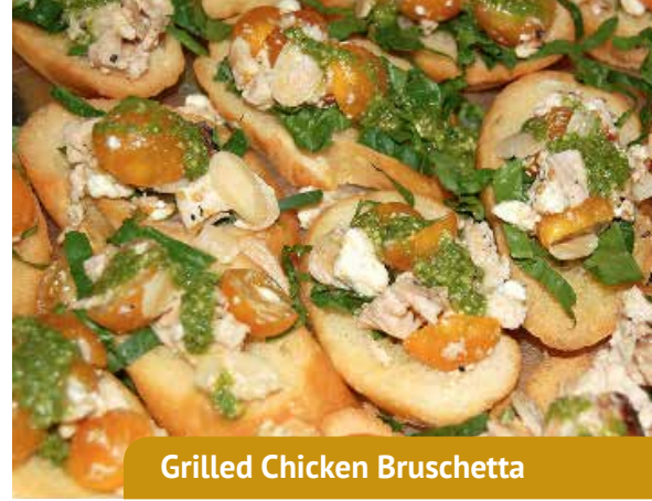
Grilled Chicken Bruschetta