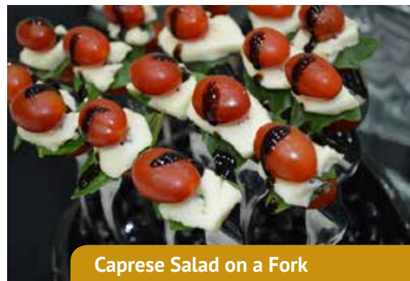
Caprese Salad on a Fork