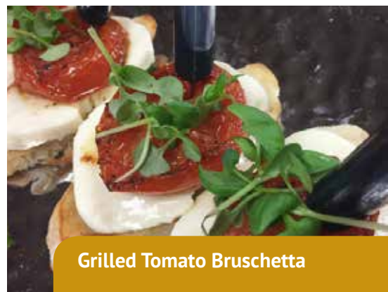
Grilled Tomato Bruschetta