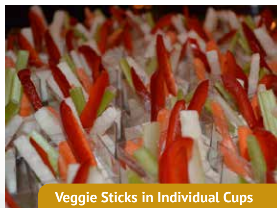
Veggie Sticks in Individual Cups