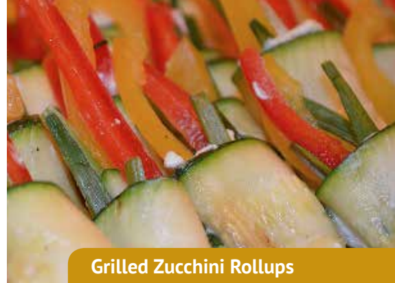
Grilled Zucchini Rollups