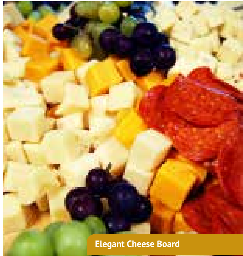
Elegant Cheese Board