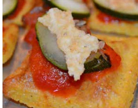
Polenta Square with Marinara and Zucchini