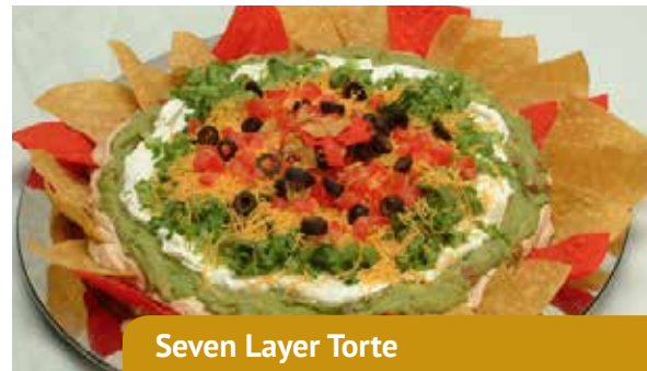
Seven Layer Torte