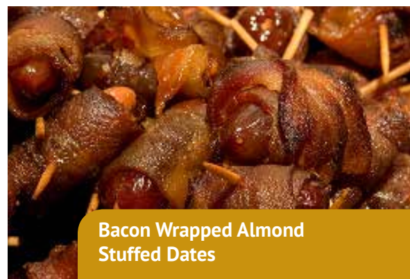
Bacon Wrapped Almond Stuffed Dates