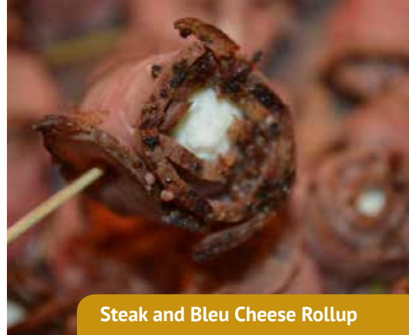
Steak and Bleu Cheese Rollup