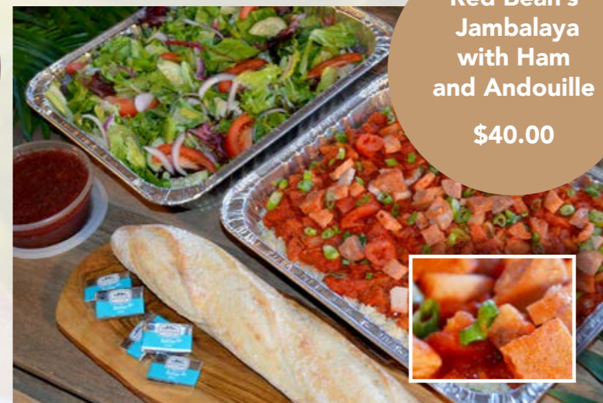
Red Bean's Jambalaya with Ham and Andouille $40.00