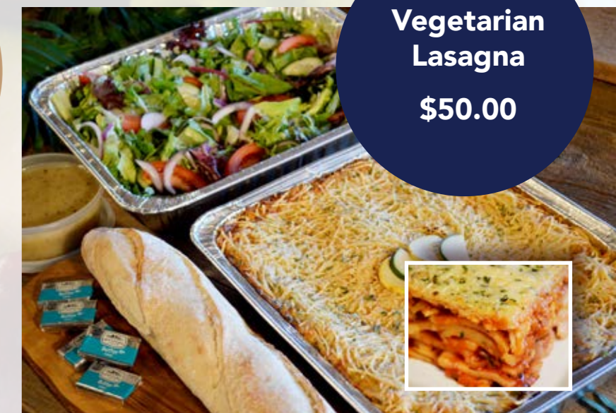
Vegetarian Lasagna $50.00

quick • safe • delicious • quick • safe • delicious