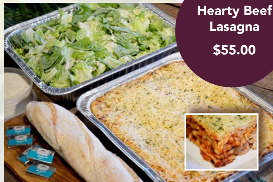
Hearty Beef Lasagna $55.00