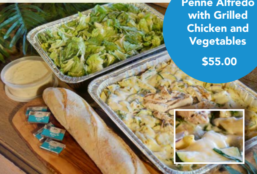
Penne Alfredo with Grilled Chicken and Vegetables $55.00

Each feeds 6-9. All meals include entrée, salad, dressing, baguette, and margarine. Order hot for immediate consumption or chilled for later re-heat.