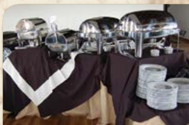
Elegant Food Display