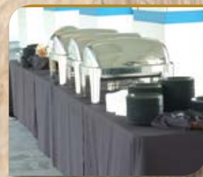
Simple Food Display