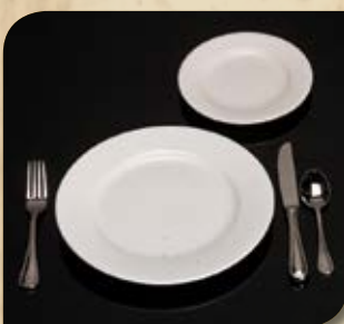
China Place Setting