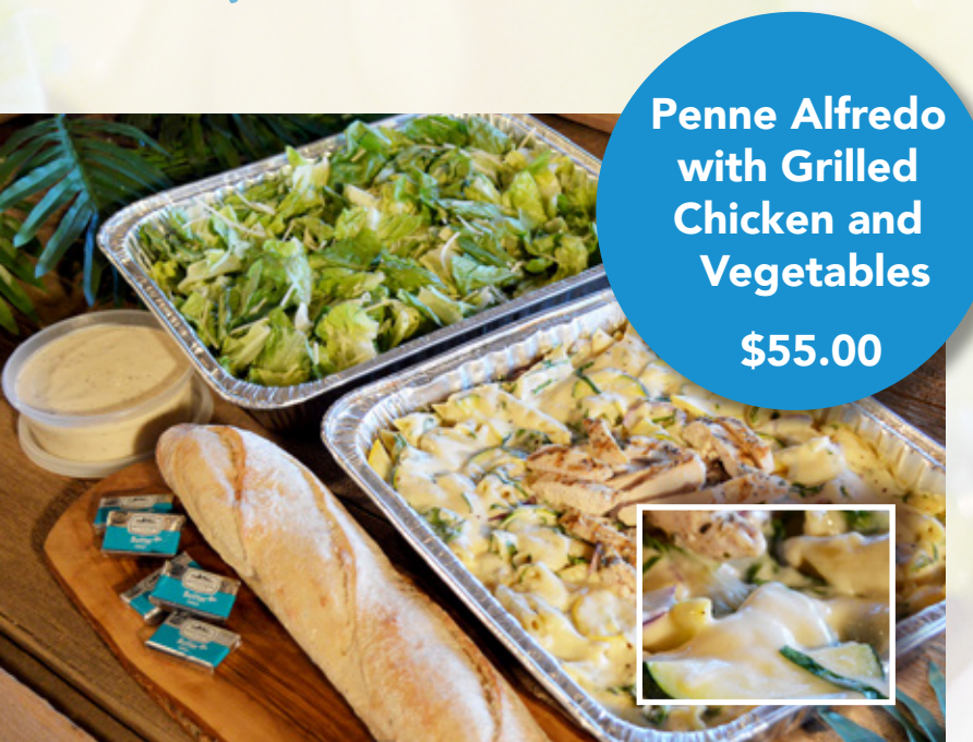
Penne Alfredo with Grilled Chicken and Vegetables $55.00

Order hot for immediate consumption or chilled for later re-heat