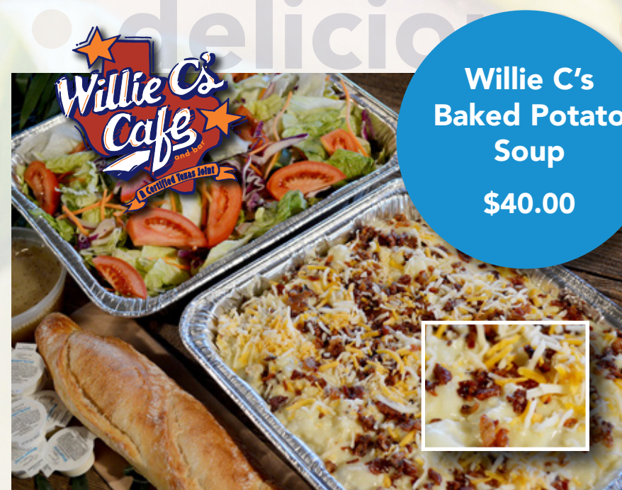
Willie C's Baked Potato Soup $40.00