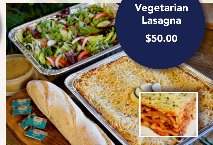
Vegetarian Lasagna $50.00