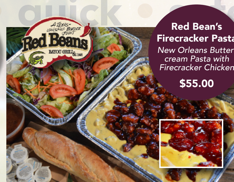
Red Bean's Firecracker Pasta New Orleans Butter- cream Pasta with Firecracker Chicken $55.00