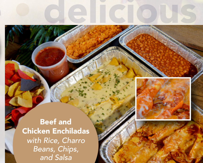
Beef and Chicken Enchiladas with Rice, Charro Beans, Chips, and Salsa $50.00