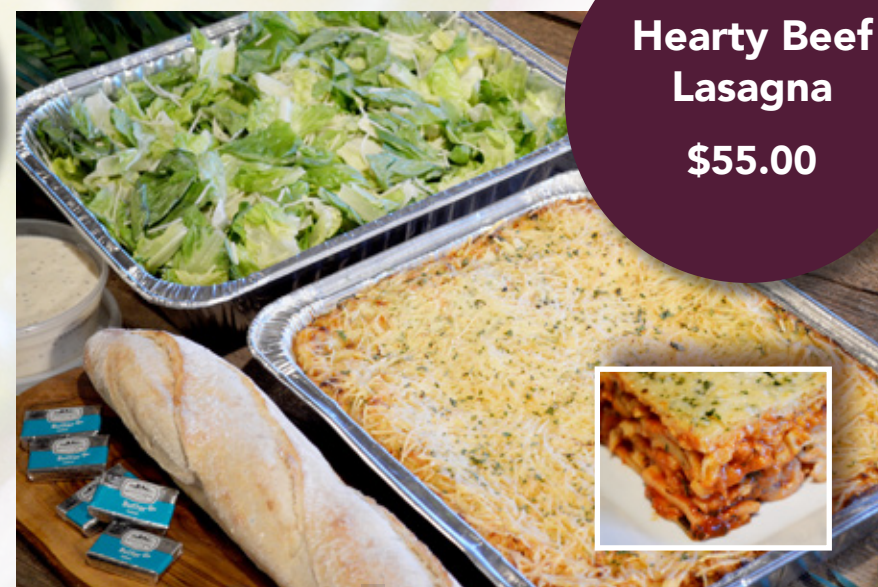
Hearty Beef Lasagna $55.00