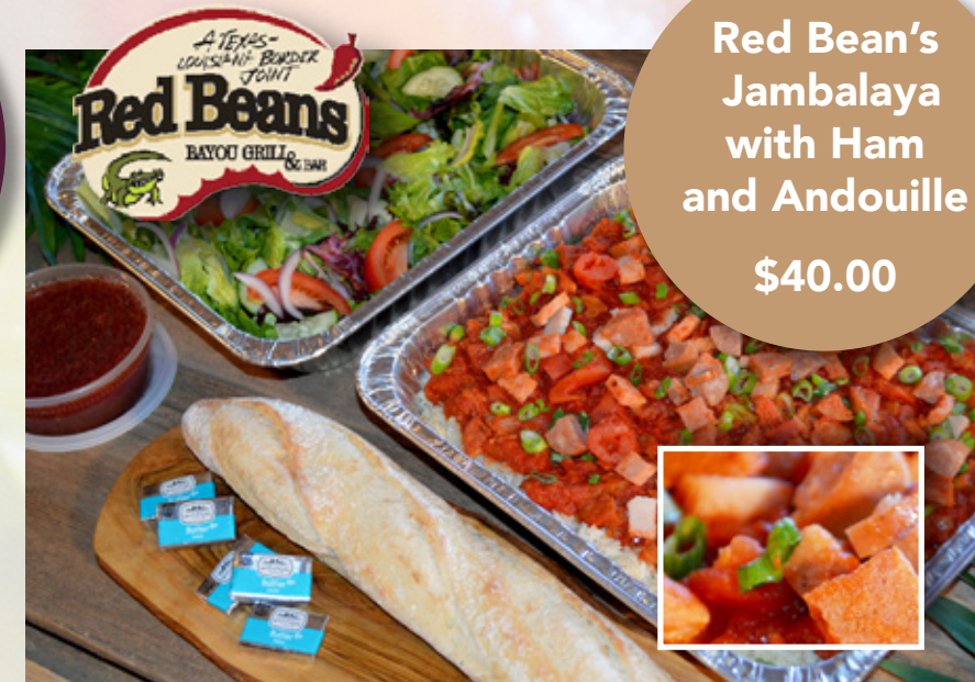
Red Bean's Jambalaya with Ham and Andouille $40.00