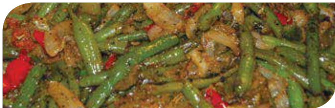
8 — Cajun and Creole; French; BBQ; Comfort Food