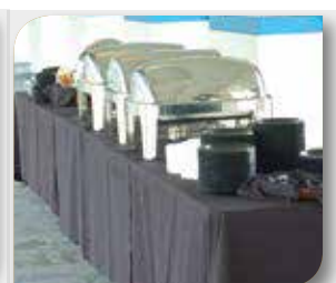
Simple Food Display