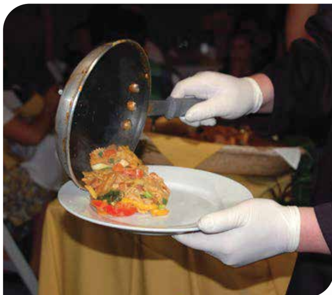
BANQUETS, WEDDINGS, AND RECEPTIONS