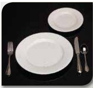
China Place Setting