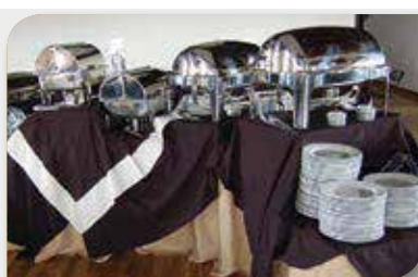
Elegant Food Display